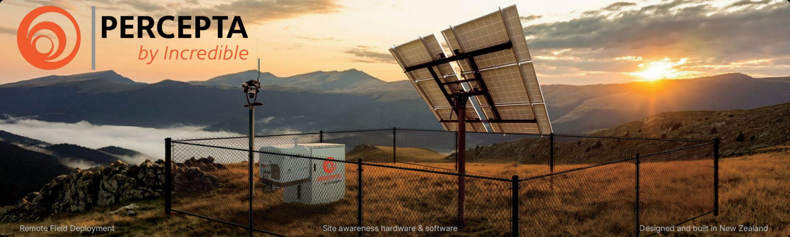
Remote Field Deployment